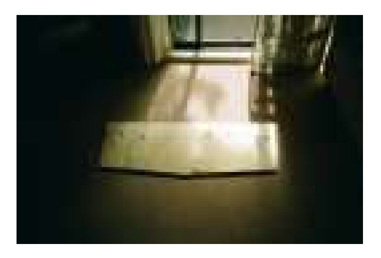
step 2: Sides

P.S. Thats the living room of my 1 bedroom apartment. Not the best place to build a boat but its what i got.