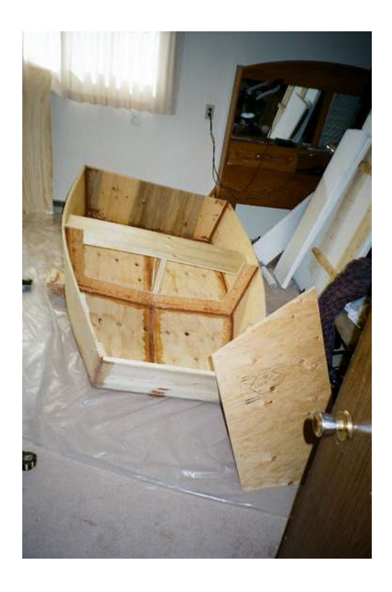
step 12: Oar Locks I bought my oars and the pin dealies they attach to but for some reason thought i'd make my own oarlocks. They work but some commercial ones might be better.